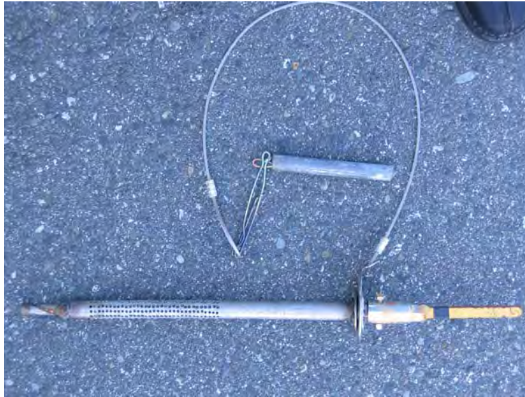
Figure 3.2 Specially constructed "tube" incubator, with anchor pin, ceramic drill bit head, and auger attachment.

At the end of the experiment eggs will be removed from each device, their condition assessed (dead or alive (sub-categories: hatched, dead alevin, live alevin). Incubation success will be calculated independently for each replicate by scoring the number of eggs that are alive or dead within each incubation device as well as the stage of development. If results of the study indicate that incubation success is not simply binary (i.e., dead or alive) it may be necessary to develop a scale by which development is measured (e.g., normal, slightly delayed, substantially delayed, dead).