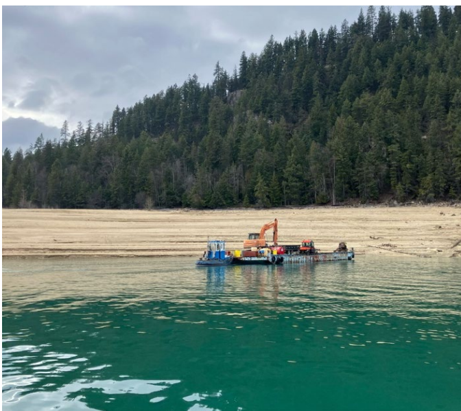
Barge crews at work near Edgewood, February 23, 2024