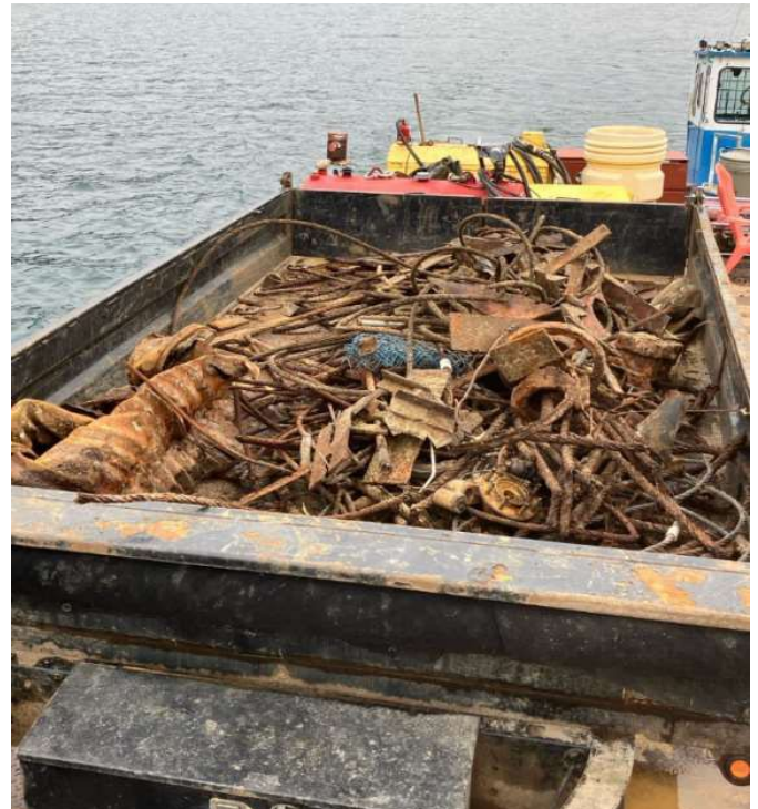
Metal collected and recycled from Shields, February 29, 2024

If you have any questions or concerns, please contact the Southern Interior Community Relations team at southern-interior.info@bchydro.com .