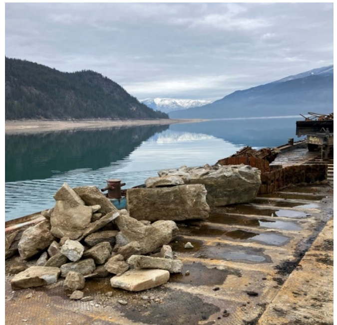
Loose concrete and other materials removed near Edgewood, February 23, 2024