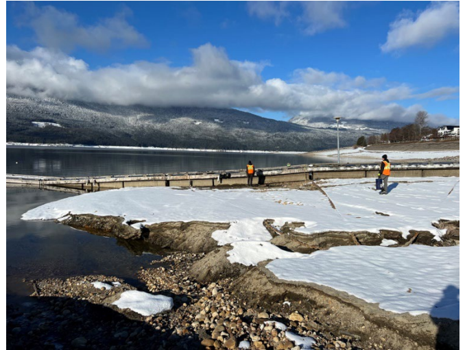
Crews begin work in Nakusp, March 8, 2024

Our efforts were concentrated in priority areas that are highly used and easily accessible, including Nakusp, Burton, Edgewood, Renata, Shields, Needles, Broadwater Road in Robson, and Arrow Park.